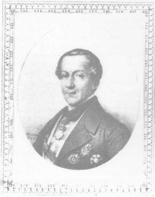
Angel de Saavedra, Duque de Rivas, who spent part of his exile in Malta between 1825 and 1830. His El Moro Exposito was dedicated to Frère.