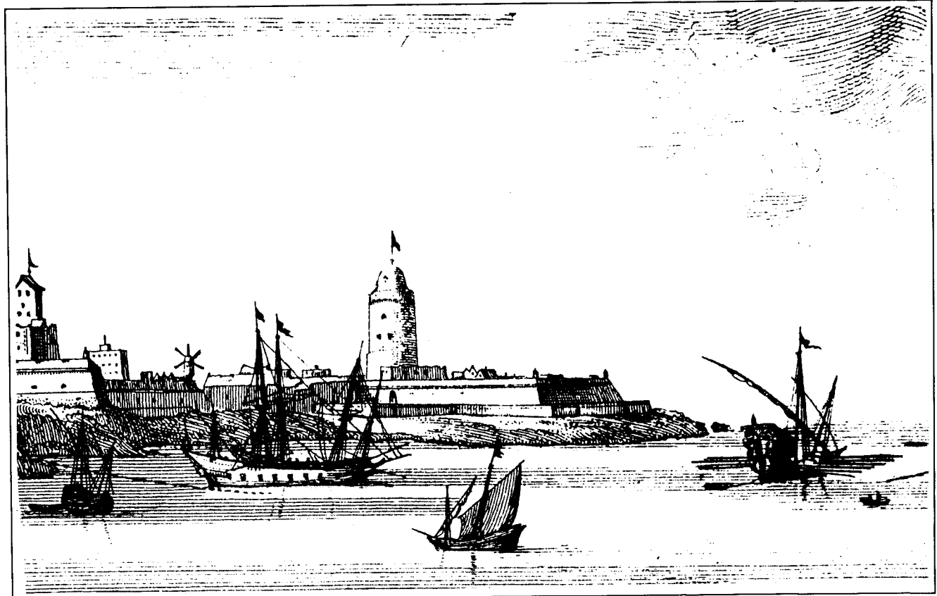
The Lighthouse of Malta: to Saavedra it became a symbol of reason 'in the midst of the fury of passion'. (From an engraving after a drawing by Jan Peters).