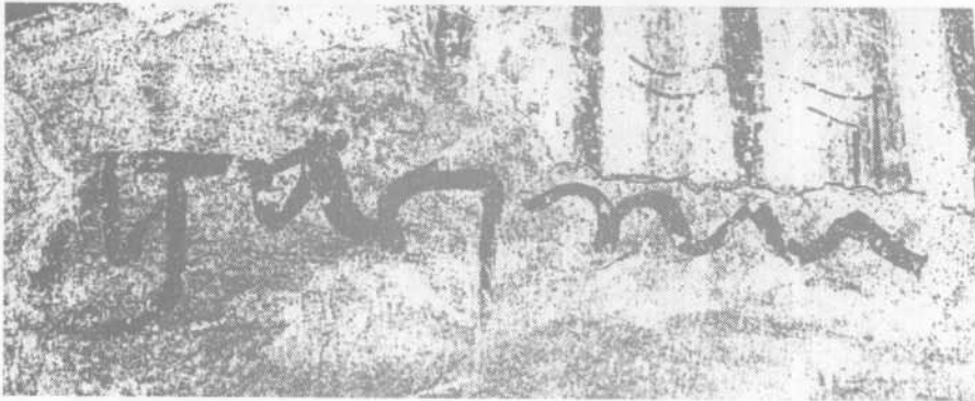
Plate 7: ANNUNCIATION CHURCH, HAL MILLIERI: St. Agatha (?) and St Blaise with a one word inscription on the sinopia skin of the mural.