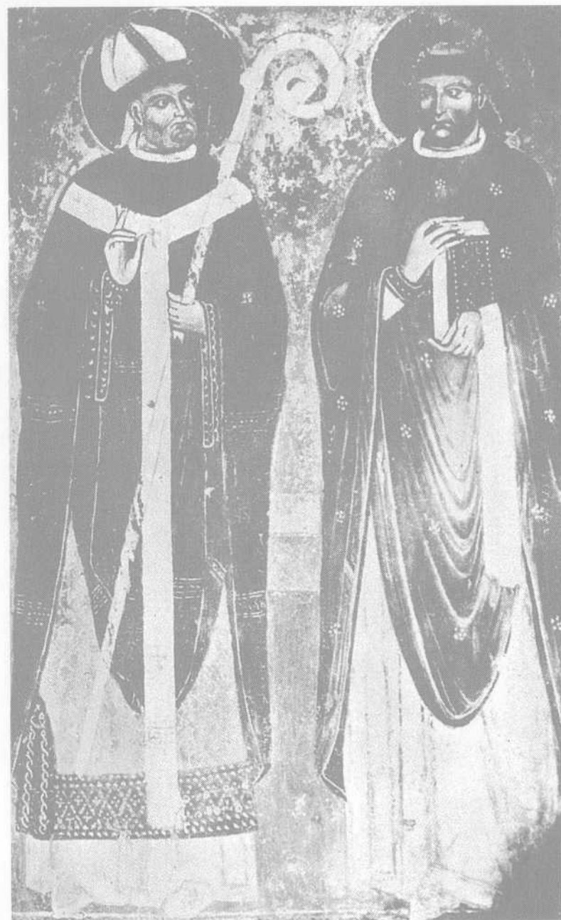
Plate 6: BASILICA OF SAN VINCENZO A GALLIANO, MILAN: Two Saints