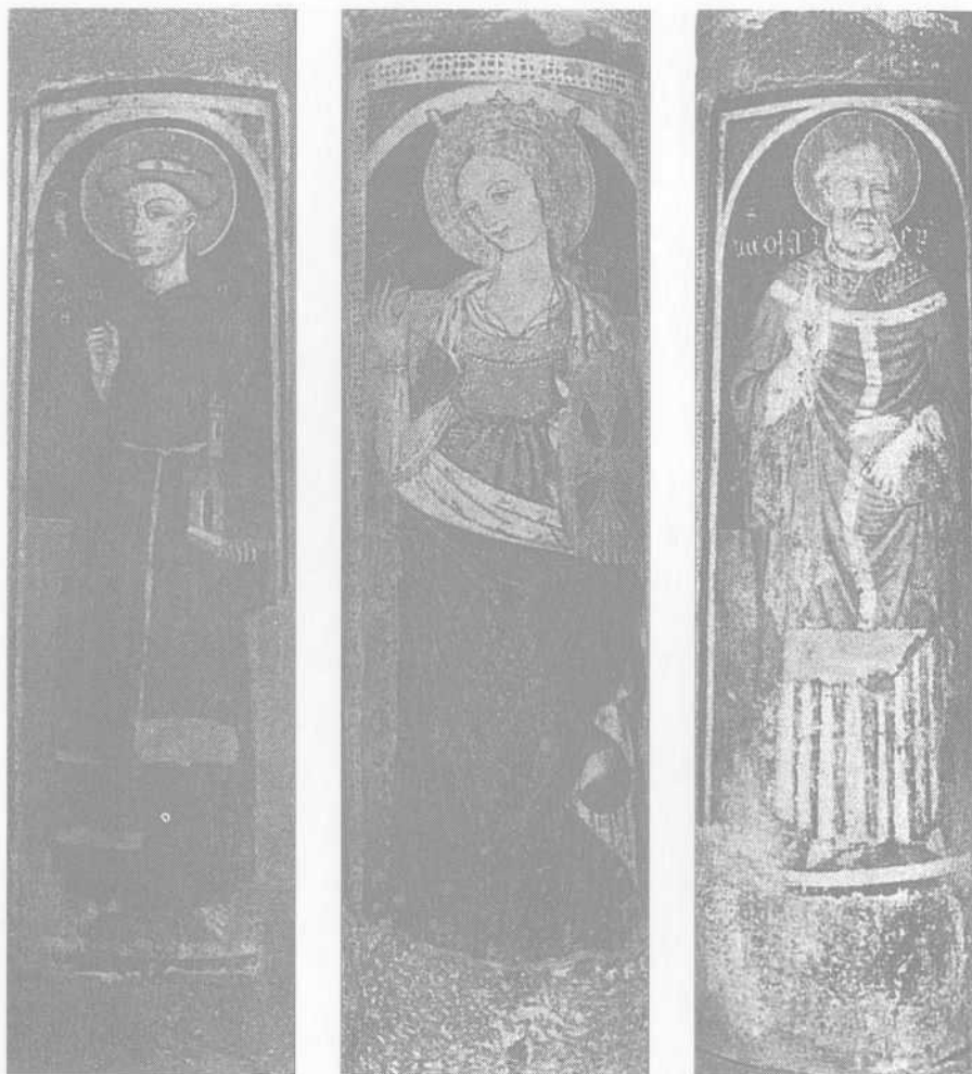
Plate 5: MATRICE VECCHIA, CASTELBUONO, SICILY: Three Saints.