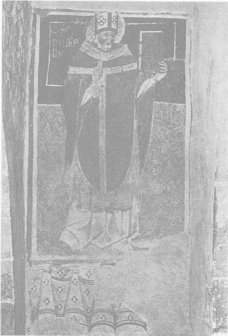
Plate 1: ANNUNCIATION CHURCH, HAL MILLIERI: St Nicholas