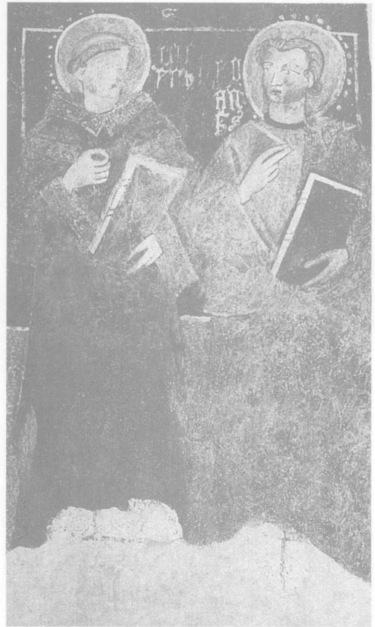
Plate 2: ANNUNCIATION CHURCH, HAL MILLIERI: Fresco of St Lawrence (left) and St John the Evangelist (right) with the name of either saint written in angular Gothic letters near the haloed heads.