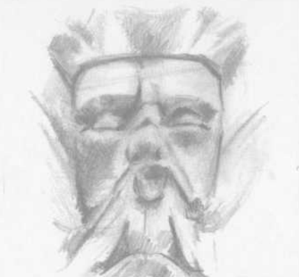
25, St. Barbara Bastion, Valletta.