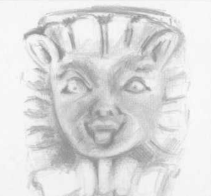
23, 24, 25, St. Barbara Bastion, Valletta.