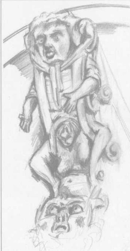
The Palace, Valletta.