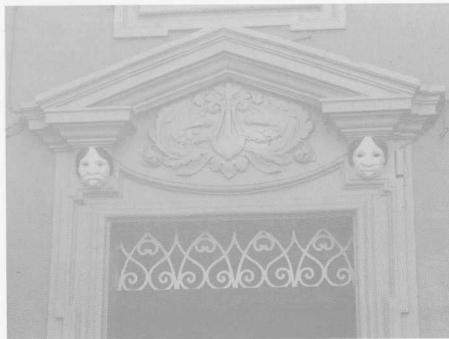
108, Merchants Street, Valletta.