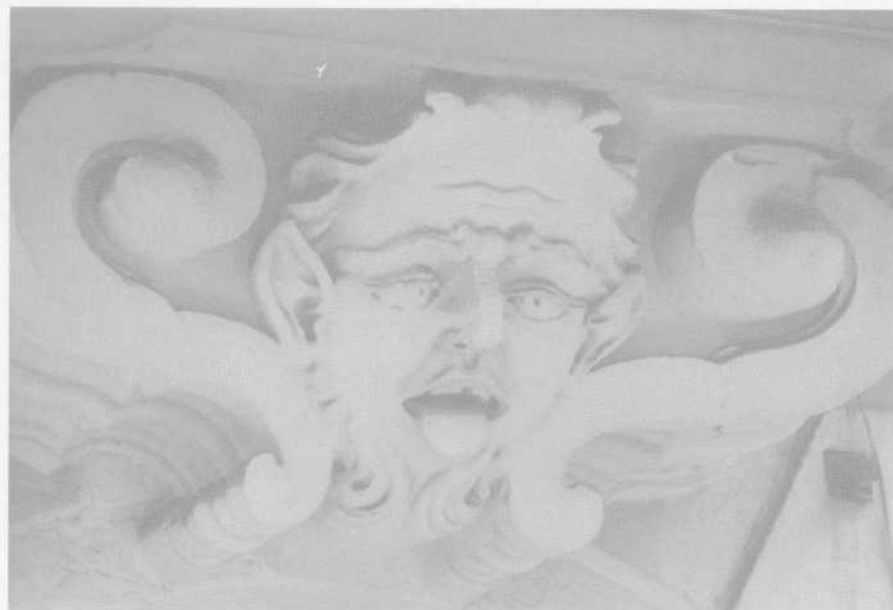
298 & 299 St. Paul Street, Valletta.

to poke their protruded tongues at us. These mute witnesses of the supernatural beliefs of our ancestors now wait to be explored and rescued from oblivion. It is hoped that this short excursus on my part will stimulate others to carry out a systematic survey of the location of these lingering echoes of the past with as exhaustive documentation as any available literary and other sources permit and with as full a photographic record as possible. Until then they are to be spared from deterioration and destruction not only as a special sculptural form of Maltese art but also as the visual expression of our past collective imagery that prompted the erection of these silent sentinels posted on the frontier separating our homes from the hostile world outside.