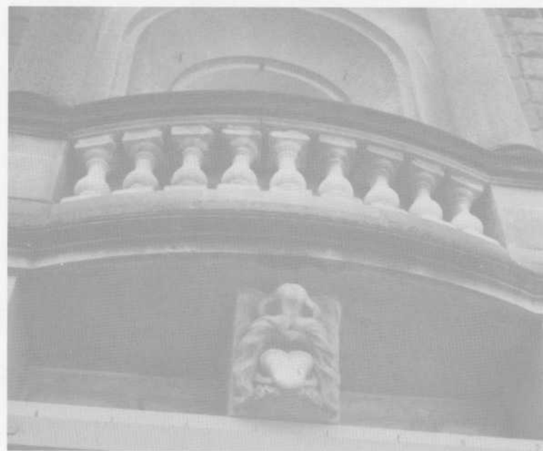
20 Lower Victoria Terrace, Sliema.