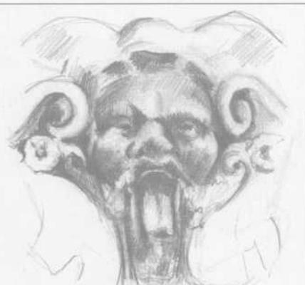
Main Street, Balzan.