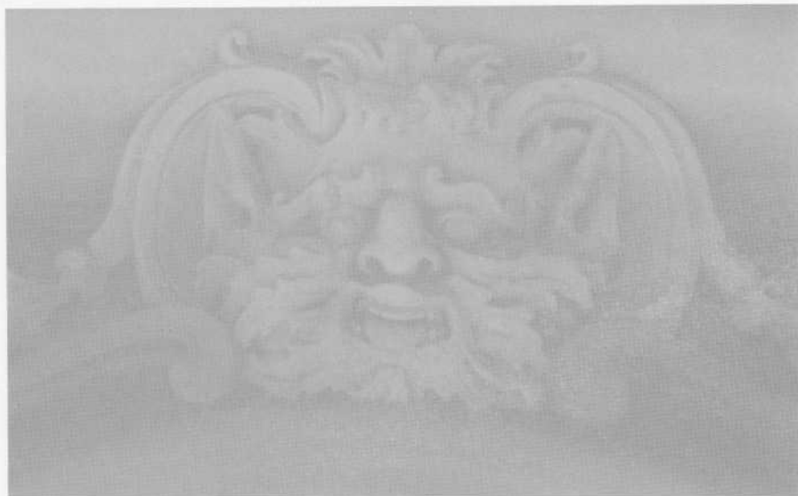
Old Hospital Street, Valletta.