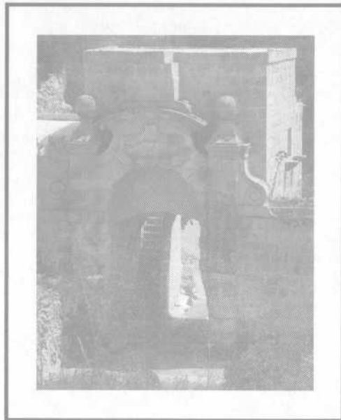
Eighteenth-century gateway to the Saqqajja Estate.