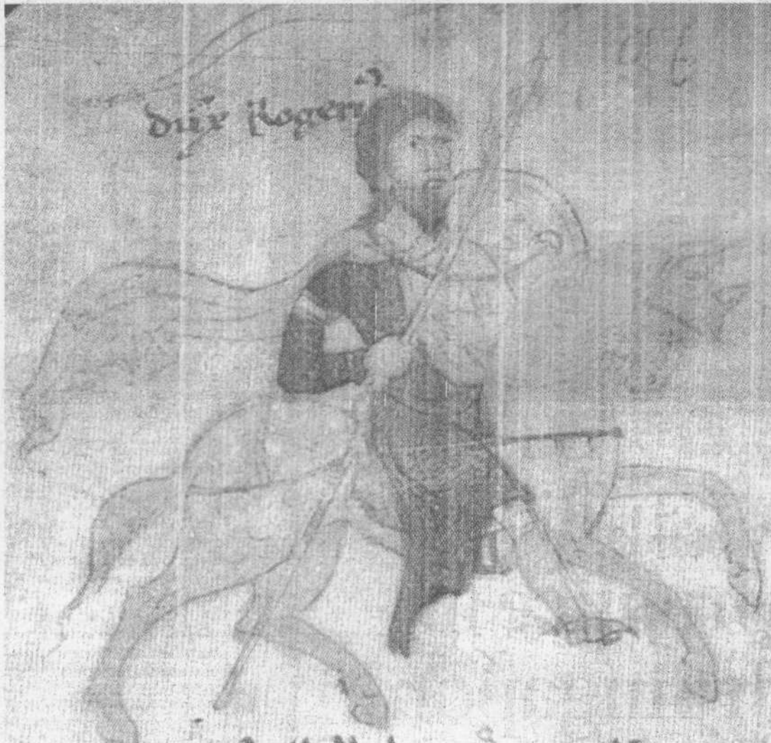
Roger II of Sicily. From the Liber ad honorem Augusti of Petrus of Ebulo, 1196.

Again, the poet does not distinguish between Malta and Gozo when describing Roger II's reconquest. On page 167 he writes "the most resplendent of all the leaders... sailed to Melitogaudos, the country of Hagar, and he subdued them". Here, too, Melitogaudos means both Malta and Gozo, since both were reconquered by Roger II. It is